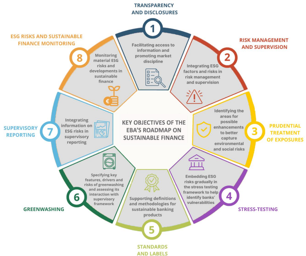
Figure 1 Key objectives of the EBA's Roadmap on Sustainable Finance