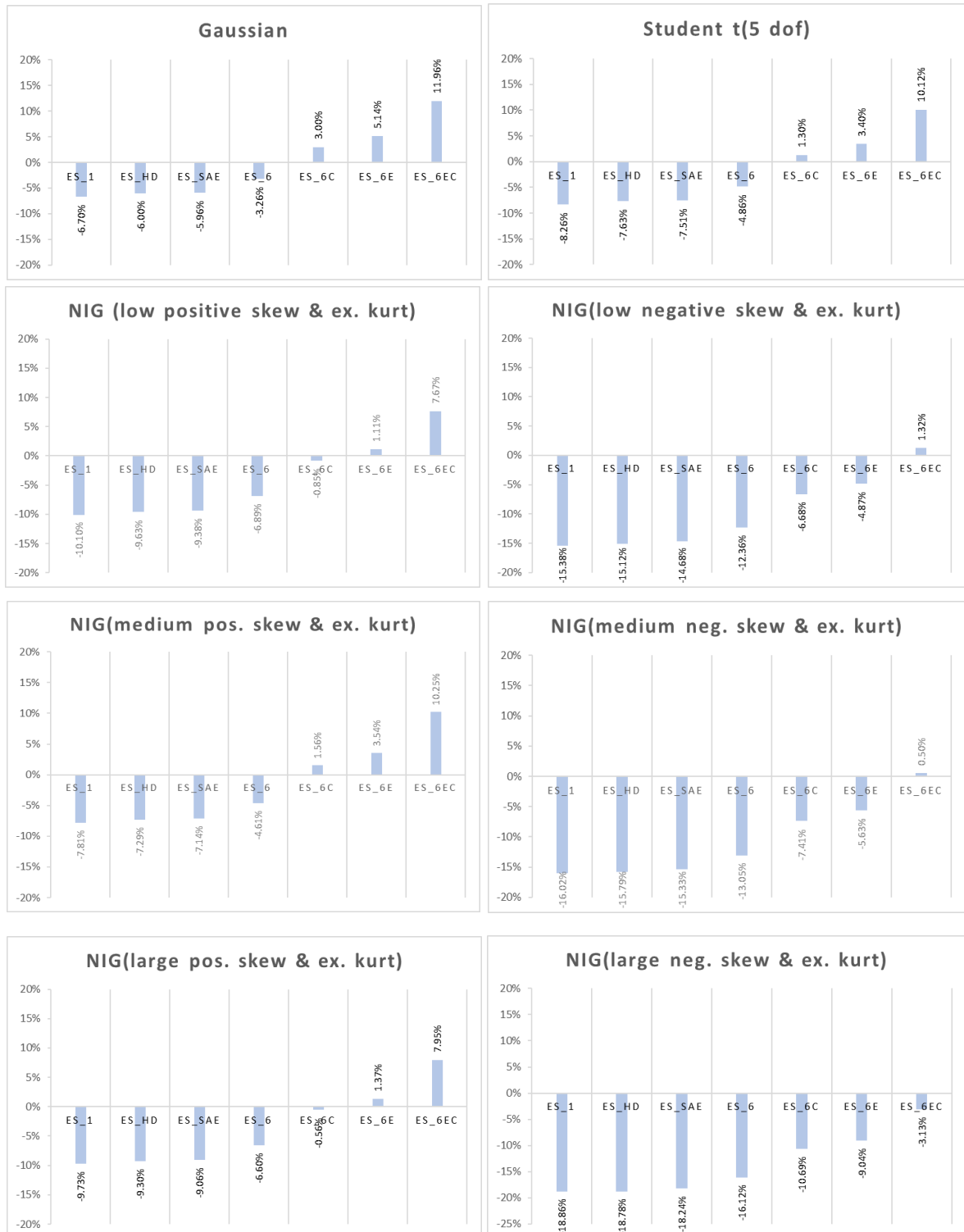
Figure 3: Expected shortfall estimation bias of 255 overlapping 10 days returns vs. the true ES (obtained as formulaic or large sample value) for different daily return increment distribution assumptions.